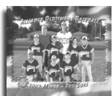
Team Photo With team name, year and league on the print.

Steph's Studio Inc. PO Box 964 ~ 210 Box Butte Ave. Alliance (308)762-7655 www.stephsstudio.com