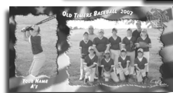
MEGA Memory Mate- 16x8