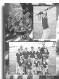
Memory Mate Composite Team and individual photo on one 8x10 print.

Trading Cards Personalized Also, with team photo on Back.