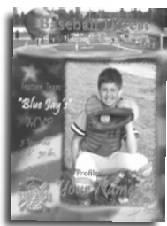
Magazine Cover 8x10